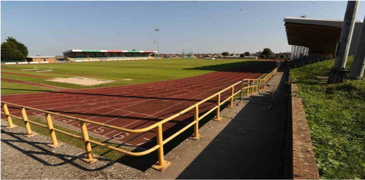
East Stand & Gladstone Road End

Recent years have seen the addition of a special viewing area for wheelchair users in the grandstand (known colloquially as the 'Old Stand'), accessible via the stadium's Devon Avenue entrance. Most recently, August 2015 saw work undertaken on installing a new, state-of-the-art 3G pitch, completed in October 2015. Wales manager Chris Coleman was on hand for the official opening.