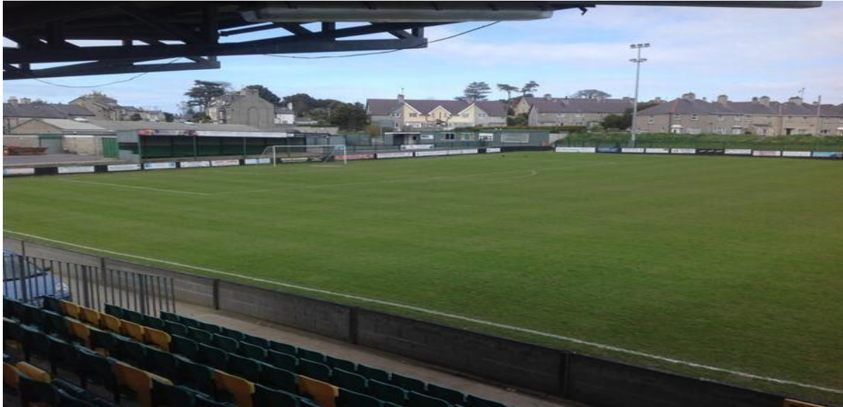
Marcus Street End

The Oval is quite an open ground with portions of open standing areas on three sides. On one side is the small but smart looking Main Stand. This covered all seated stand is free of any supporting pillars and gives good views of the pitch. Sitting astride the halfway line it runs for around a third of the length of the pitch, with flat standing areas on either side. Unusually the team dugouts are not located in front of the Main Stand, but on the opposite side of the ground on the East Side of the ground are largely open standing areas, although one side running up towards the Club Shop in one corner, the standing area is elevated.