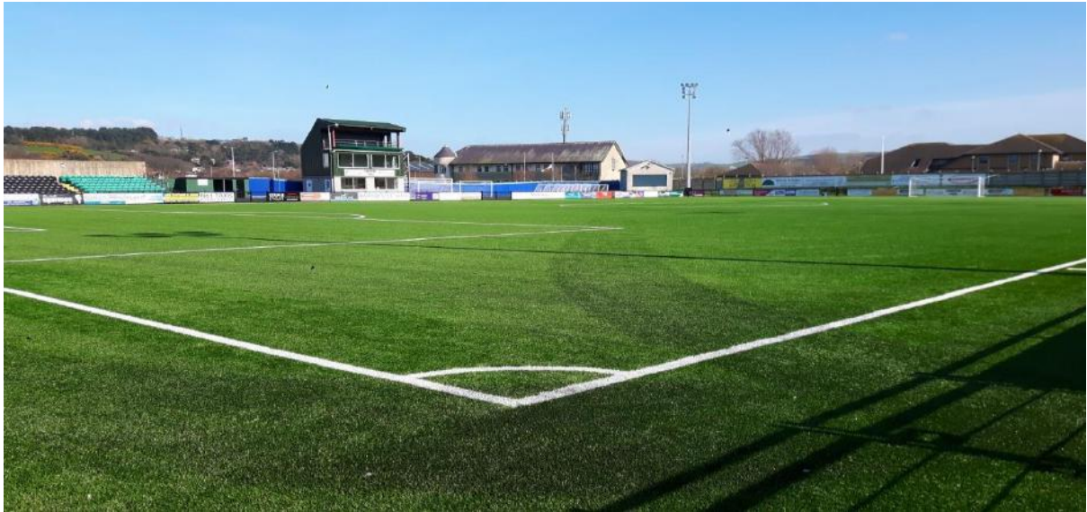
Media End & Shed End